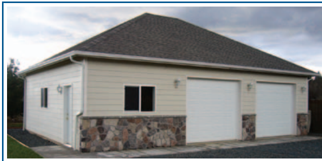
Two-car garage with woodshop and home office area. Shown with hip-roof on a 7/12 pitch, concrete apron and sidewalks.