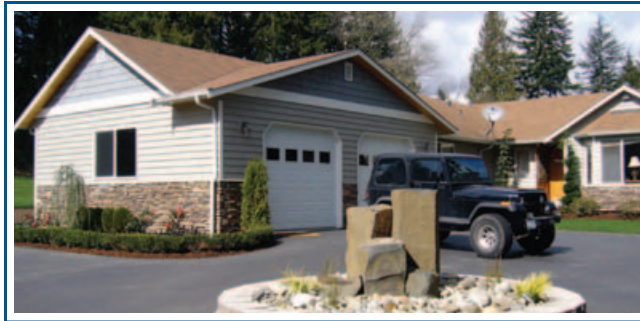
Custom garage addition added to an pre-existing home. Included stonework, hardi-plank siding and roofing to match the customers home.