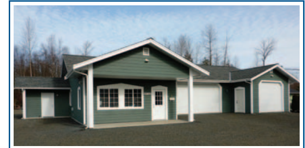
Northwest Garages office and showroom is located in Snohomish. Call for an appointment today!*

—Your Neighborhood Full Service Contractor Since 1980—