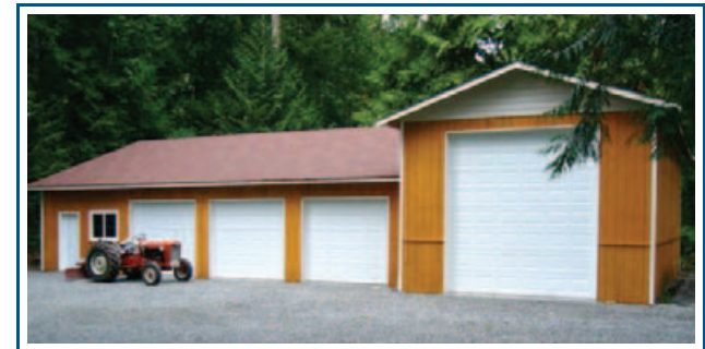
This building has it all! Three single car stalls to store all your toys, with RV garage and even workspace and storage room.