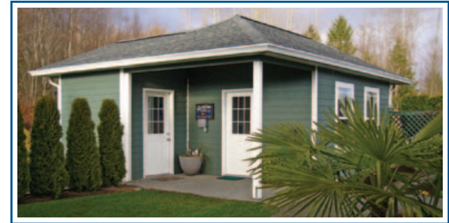
Versatile building that can be used for just about anything from art studio to guest quarters.