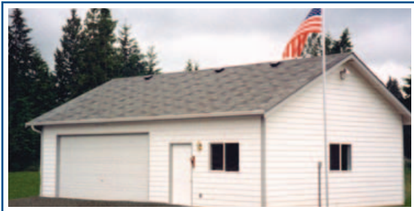
Northwest Garages's standard building, 28' x 36' x 10' (1008 sq. ft.). Double car garage with workshop and storage.