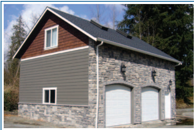
Custom two-story building with stone work and cedar shingles designed to match the architecture of the owners existing home.