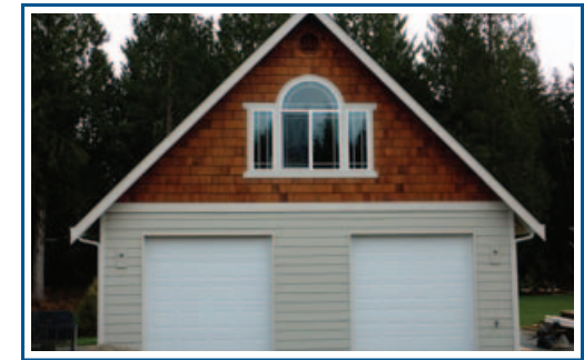
Custom two-car garage with loft above. 28' x 28' x 10' with hardi-plank siding and custom windows.