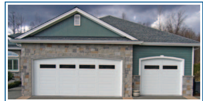
Unique hip-roof design, double car garage with an additional single car garage set back gives more dimension and street appeal.