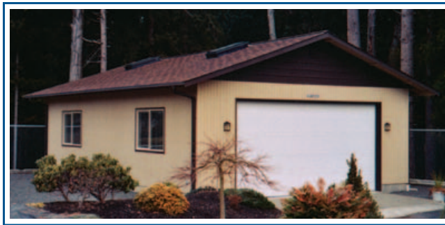
Traditional 24' x 36' x 10' (864 sq. ft.) double car garage with lots of room in the back for workspace and storage.