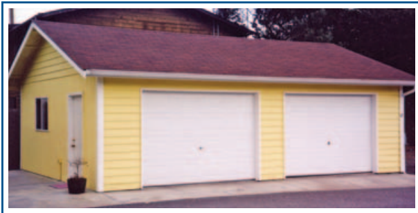
Northwest Garages's standard building. 24' x 24' x 10', 2-single car garage (576 sq. ft.).