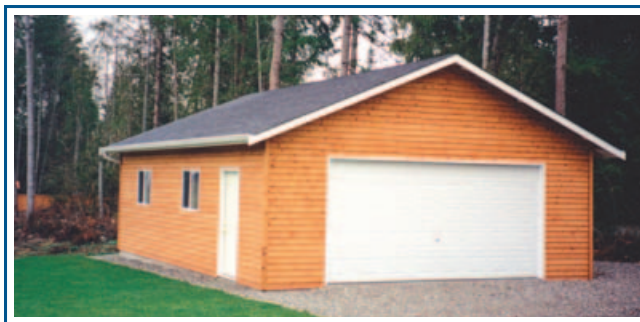
Classic two-car garage with shop. 24' x 36' x 10' with cedar lap siding.